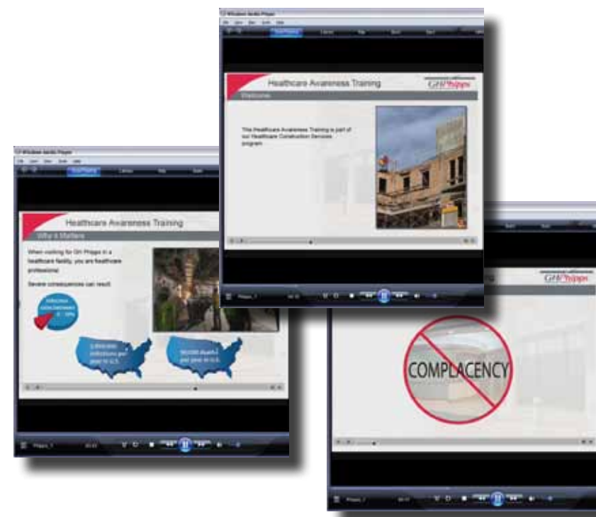
After the training, any of GH Phipps' personnel can answer how they work differently in healthcare construction. The pc-based training tests competencies at learning checkpoints throughout the modules. The enhancements to the training ensure that personnel completely understand their responsibilities unique to healthcare construction projects.

Prior approaches addressed more of the scientific and disease containment aspects of healthcare construction. The new modules focus on why an individual builds differently, and behavior enhancements that are required in the workplace in a healthcare environment. Content was developed to meet the needs of a very specific targeted audience. Advanced modules for supervisors are under development.