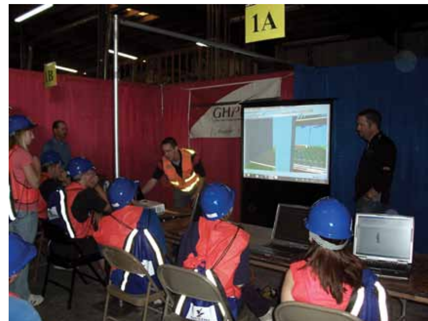
GH Phipps offered hands-on CAD/BIM activities for high school students during the Colorado Construction Career Days of Southern Colorado.